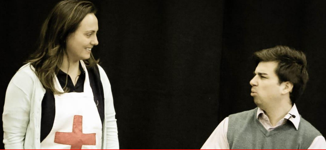
A scene from Ten Ten's family drama, Called Up